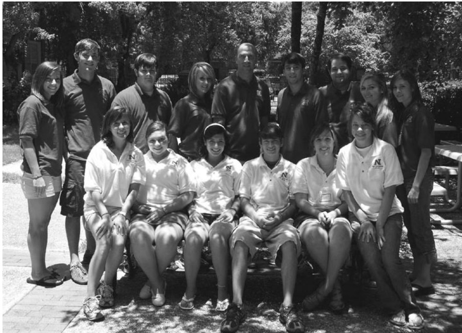
2007 Free Enterprise Week Counselors