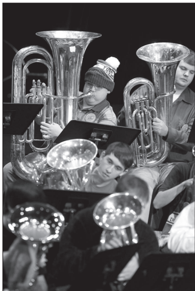
The university's annual TubaChristmas, presented Sunday, Dec. 7, in Talbot Theater, showcased the talents of area tuba and euphonium players. A growing national tradition for 35 years, the first TubaChristmas was conducted at New York City's Rockefeller Plaza Ice Rink on Sunday, Dec. 22, 1974.

Location: Bollinger Memorial Student Union, LeBijou Theater