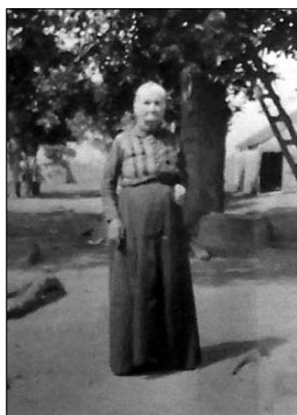
'A Glimpse into the Past' will remain on display in Ellender Memorial Library until the end of July. Approximately 25 photos have been enlarged for viewing.