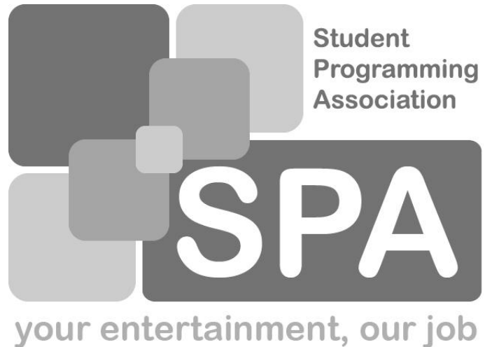
Black and White Logo (Above Right)