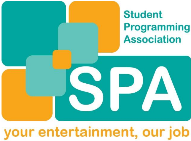
Main Logo Image (Above Left)