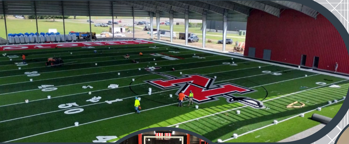
FOOTBALL COVERED PRACTICE FACILITIES